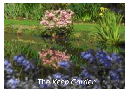
The Keep Garden

Notice: Many gardens contain ponds, open water and other water hazards. Children must be supervised at all times.