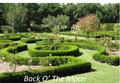
Back O' The Moon