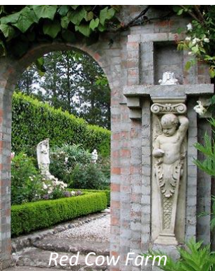
Red Cow Farm